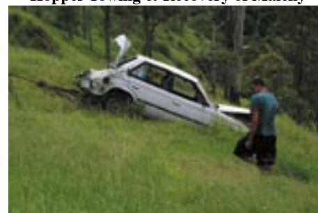
Photo below: Vehicle being recovered by Hopper Towing & Recovery of Maleny

Click here to go to our "Gig Guide" (Must be connected to the internet at the time)