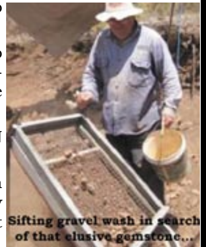
Sifting gravel wash in search of that elusive gemstone...

This is a great opportunity to learn about another interesting activity enjoyed by many Sunshine Coast residents.