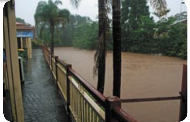
Photos above show Obi Creek behind Riverside Shopping Centre.

S.E.S. members sandbagged the Maleny library as the water continued to rise.