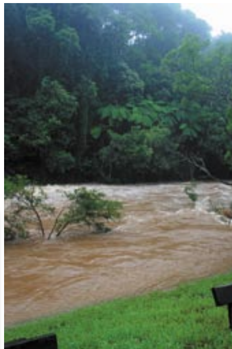
Photos above show Gardners Falls from carpark on Tues 11th January.

Gardners Falls again became a dangerous torrent of water rushing towards Baroon Pocket Dam and then onto towns further downstream such as Gympie and Maryborough.