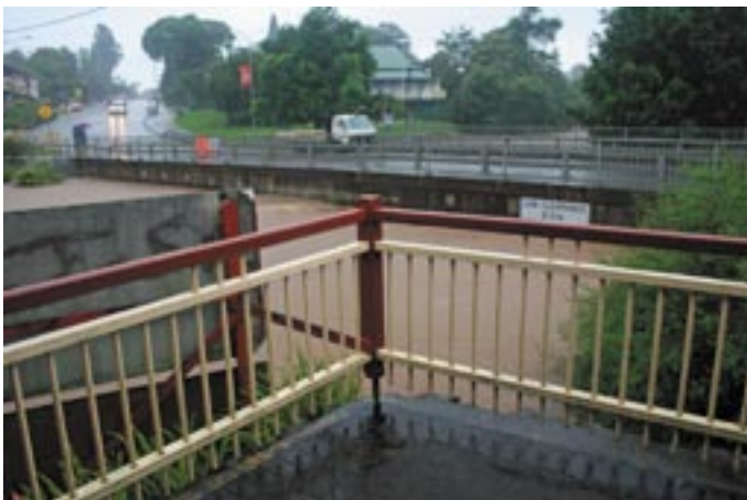
Photos above shows bridge in Maple Street, Maleny mid afternoon on Tuesday 11th.