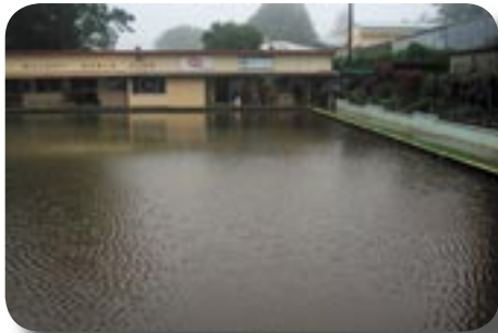
Photos below show Maleny Bowls Club Green - more like a lake.

The Maleny Bowls club green looked more like a lake than a finely cultivated grass surface. Who would have thought?