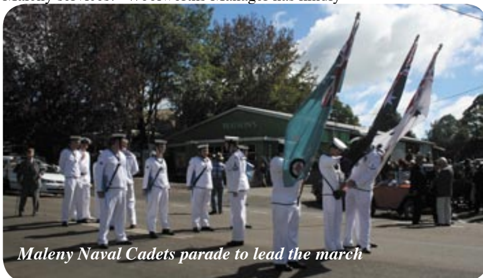
Maleny Naval Cadets parade to lead the march

The RSL and T S Centaur Cadets will be selling ANZAC Day badges in Maple Street prior to ANZAC DAY.