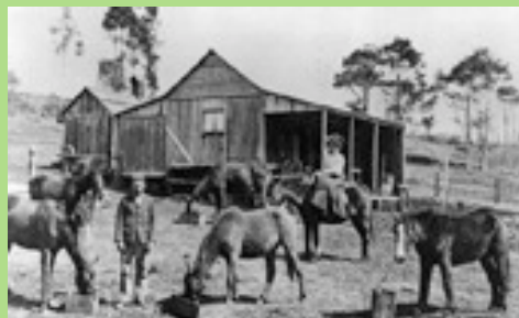
Residence typical of the day circa 1890's