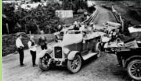
Photo Above - Austin Tourer at the RACQ 1924 reliability trials, Maleny, Queensland - Notice original bridge in Maple Street, Maleny in front of the Maleny Hotel.

It is no surprise that timber was important to the economy of the area. The first sawmill was established in 1890 by the Lahey family, then sawmills were established almost on every corner. Timber for selector's homes was