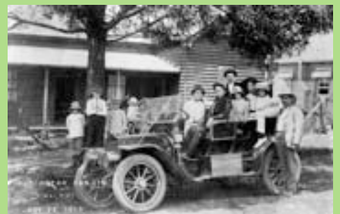
Men, women and children gathered on and around the first motor car in Maleny, Queensland, 1913 - a Cadillac Model 30 Tourer