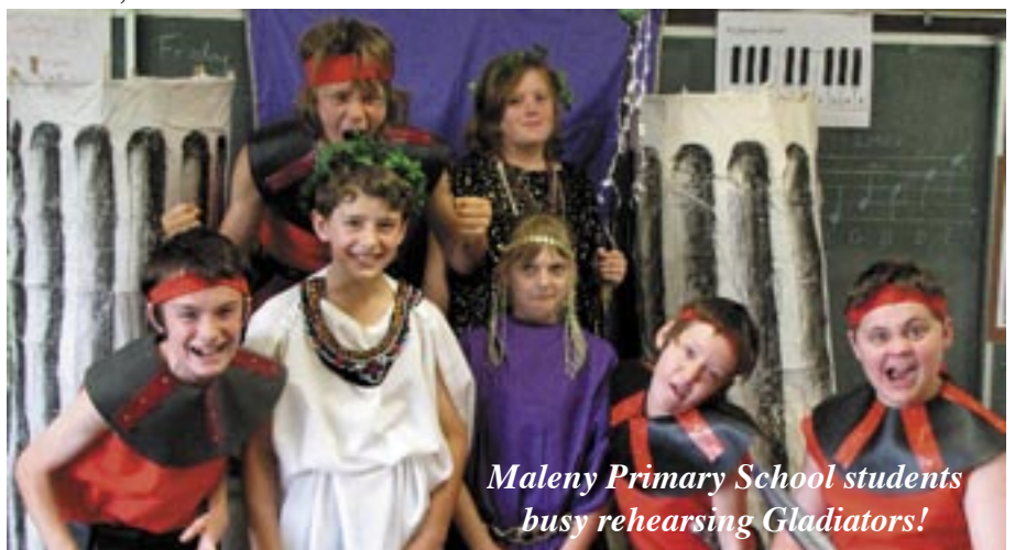
Maleny Primary School students busy rehearsing Gladiators!

Tickets: adults $10.00, students $5.00 or a family ticket $25.00 (2 adults and 2 children) Bookings at the school or The Bower Bird Maleny.