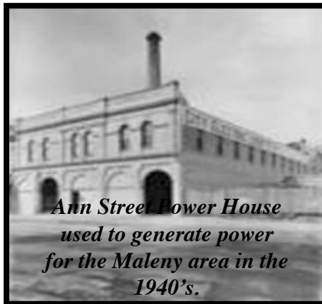
Ann Street Power House used to generate power for the Maleny area in the 1940's.

During the construction of the electrical network a construction gang, camped in the Maleny Show Grounds. They erected a 33,000 volt transmission line from Woodford to Nambour. A 33,000/240 volt transformer was positioned on a two-pole sub-station outside the Maleny Butter Factory to provide power to Maleny township. It was the first electric transformer station on CEL's North Coast feeder.