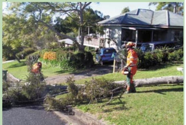
Photo above - SES Members attending to the fallen tree.

Members of Maleny SES Group attended and safely cut the tree up so that it could be removed from the scene allowing access to the property.