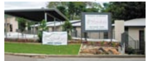
Pomodores Restaurant and Cottages new location in Lawyer Street, Maleny

The luxury cabins, in particular, are an exciting new addition to the hub of Maleny with guests able to simply stroll to the boutiques, bookshops and galleries of Maple Street, or just relax in the comfort of their spa bath with views over the beautiful Obi Obi Creek.