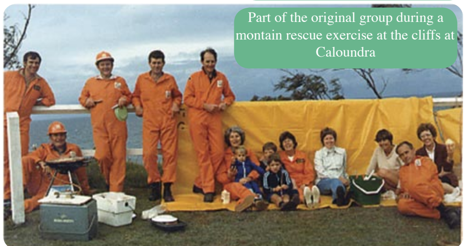
Part of the original group during a mountain rescue exercise at the cliffs at Caloundra

Visit our web site: http://www.hinterlandgrapevine.com