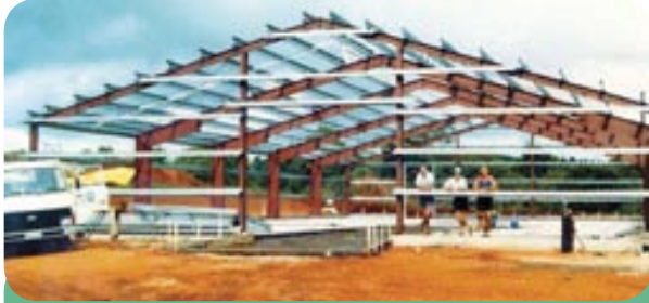
SES & Show Society volunteers working on building their HQ

Society and the Caloundra City Council to jointly built a new home, now known as the Maleny Dairy Pavillion and Maleny SES HQ which is situated in the Maleny Show Grounds. That remains their HQ today.