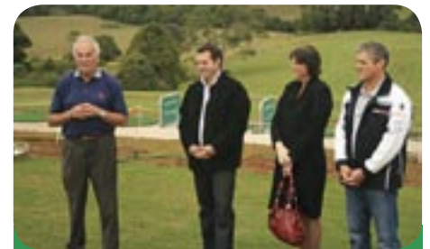
Official opening of the Golf Club chipping area